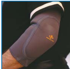
TS212 Elbow Padded