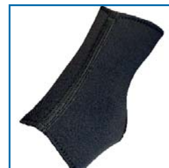
TS204 Ankle Wrap