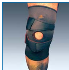
TS866 Patella Tracking Stabilizer