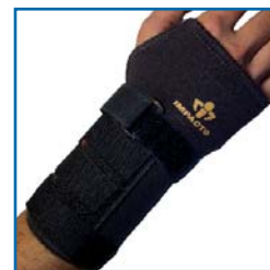
TS242 (L), TS243 (R) Carpal Tunnel Brace