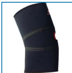
TS209 Knee Patella