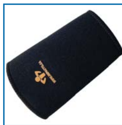
TS216 Wrist Support