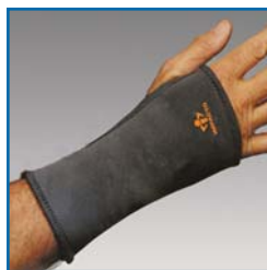
TS214 (L), TS215 (R) Wrist / Hand support