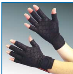
TS199 Thermo Glove