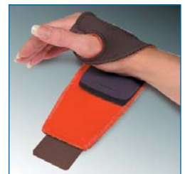
TS226-UREST Rest pad for keyboard operators