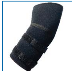
TS228 Elbow Support w/strap