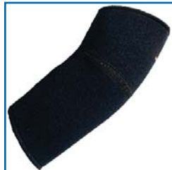
TS217 Elbow support