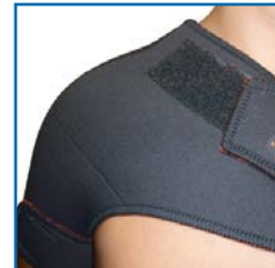
TS230 Shoulder Support