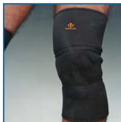
TS208 Knee Support