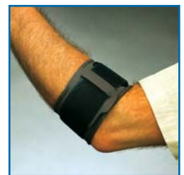
TS205 Tennis Elbow Padded