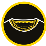
TAPED NECKLINE FOR COMFORT