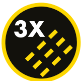
TRIPLE STITCHED SEAMS