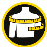
LARGE SIZE RANGE